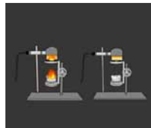
Step 3 – NF P92-505