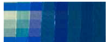
Standard reference blue scale